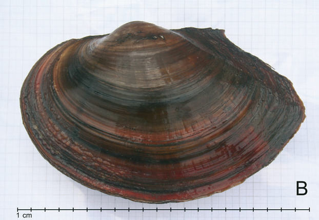
Fig. 2. A nine-year old specimen of Anodonta cygnea (Linnaeus, 1758) (A) and a more than three-year old specimen of Sinanodonta woodiana (Lea, 1834) (B) found in the fish ponds near Budy Głogowskie.

sic descriptive statistics for the studied populations are given in Table 1.